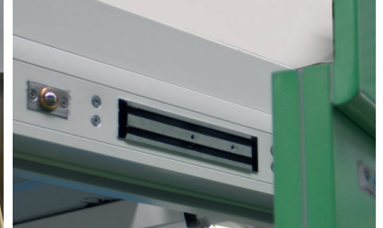
lock and plate